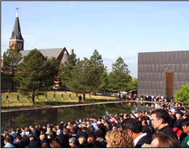
Those attending the 15th anniversary ceremonies of the bombing in 2010 gathered under beautiful blue skies.