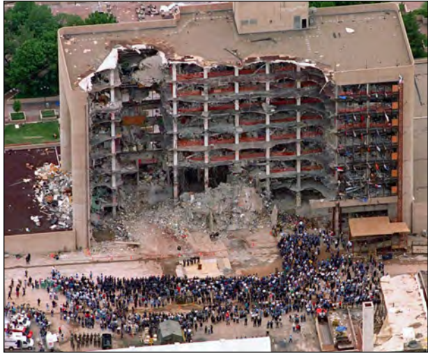
The north side of the Alfred P. Murrah Federal Building after a bomb exploded on April 19, 1995.

Records showed that as of Aug. 9, 1995, donations to help vic-