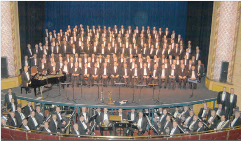
In 2003, the Singing Churchmen of Oklahoma attracted a large crowd to their concert in the world-famous Sydney Opera House.