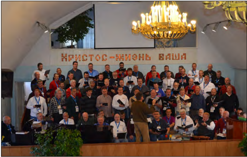
The Singing Churchmen of Oklahoma present a concert at Golgotha Baptist Church in Moscow, Russia in 2014.